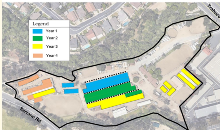
Phased Infiltration Trench Installation

Depending on this year's winter, we hope to get a jump on the next year's quota by beginning before the official time clock starts in April. Those in the green stalls (Year 2) you're next up!