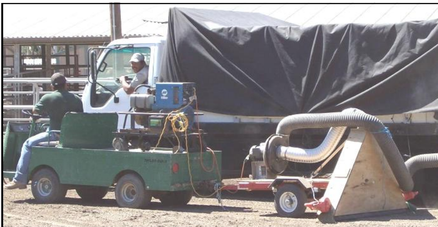
Shown here is the first run of the prototype arena vacuum. The black fabric on the truck was later replaced with a giant sealed dust bag to eliminate dust leakage.

Tesla, I had a spark of an idea. Why can't we do the same with the arenas? Now rather than dealing with all the footing under the sifting regime, instead let's just target the dust. The key must lie in dust's unique suspension property. Getting back to the sweeper truck, I initially thought; let's just buy a sweeper, drive it around the arena a few times and we'd be done for the week. (Maybe we can post a few no parking signs and a meter maid can drive ahead and cite those horses for being in the arena as an additional income source!) Anyways the bad thing is that these trucks' vacuums are so powerful that it would suck up everything. So this easy answer was out.